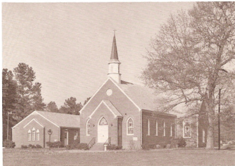
Mt. Zion Church.