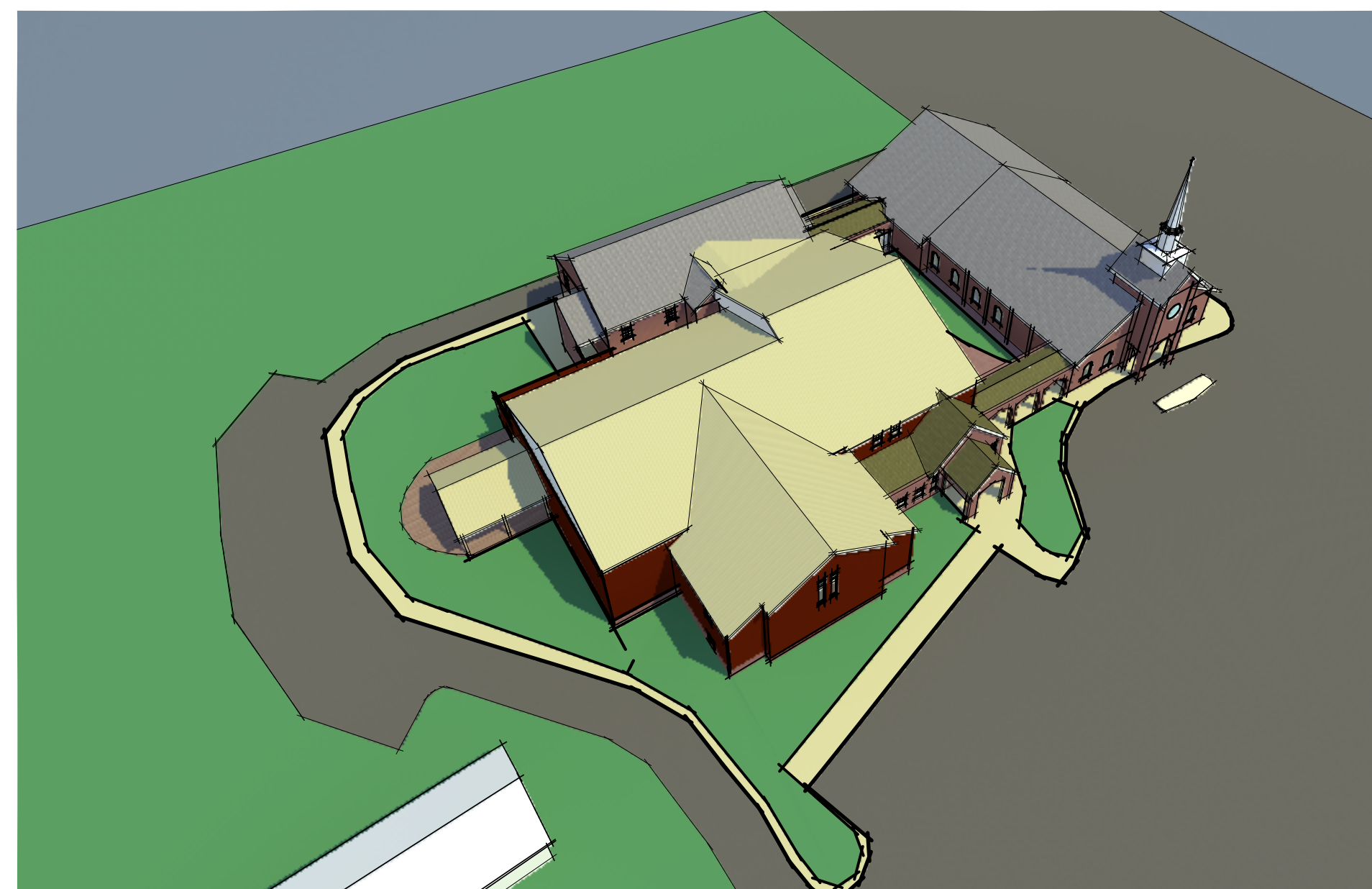
SITE BIRDSEYE 1