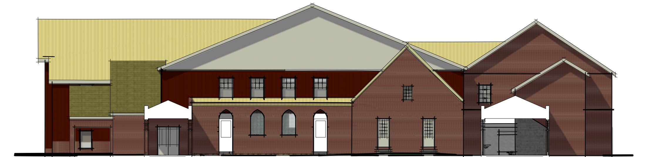
SOUTH COURTYARD ELEVATION