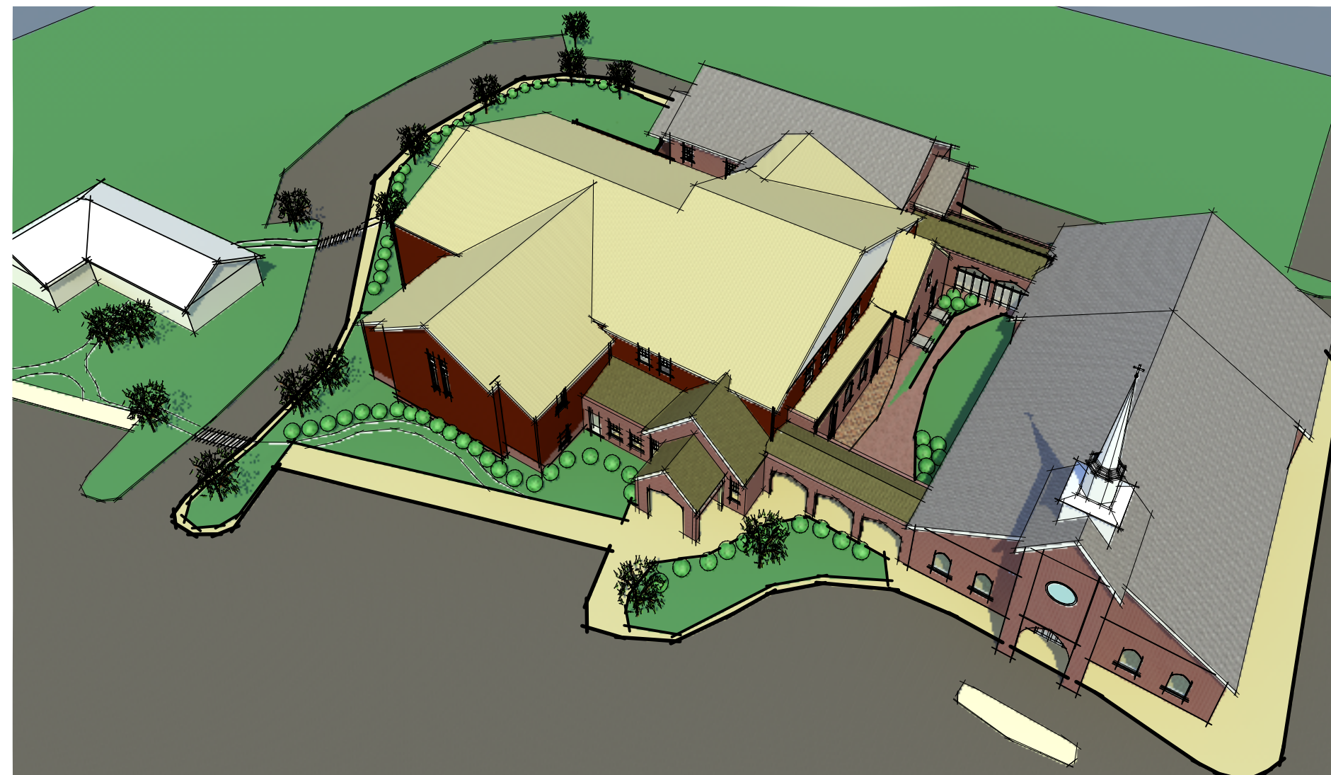
SITE BIRDSEYE 2