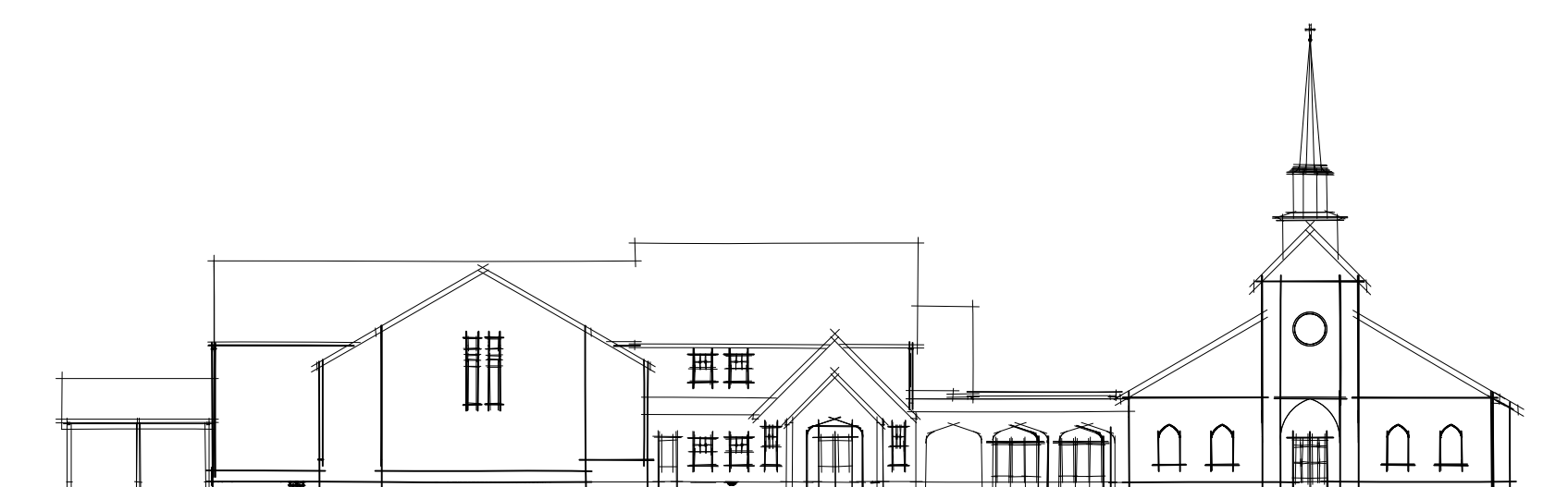
MOUNT ZION U.M. CHURCH MULTIPURPOSE BUILDING

SCALE AS NOTED 15772 NC 50 NORTH GARNER, NC 10/17/15 mtz bldg 5.01.vwx