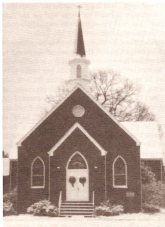
Christmas 1974 - Mt. Zion in the snow.

We are thankful and proud that our Church has continued in the work of our Lord for so many years.