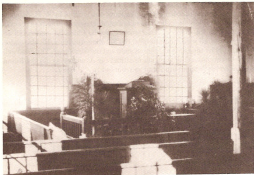
Interior of old Church.